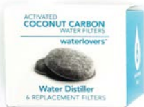
Premium quality activated coconut carbon filters