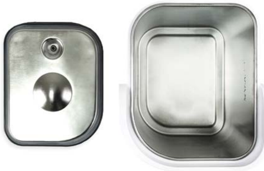
Food grade 304 Stainless Steel reservoir and cover