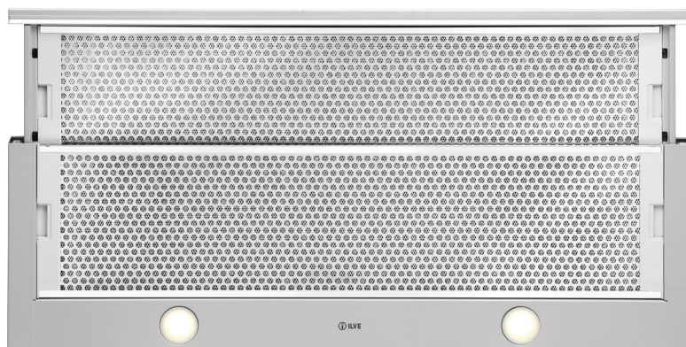
Pictured: CSP90 - 90cm Slideout Hood: under side