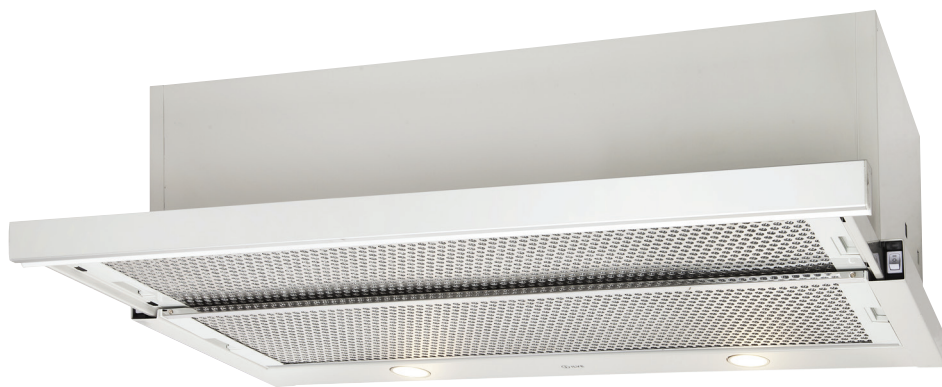
Pictured: CSP90 - 90cm Slideout Hood