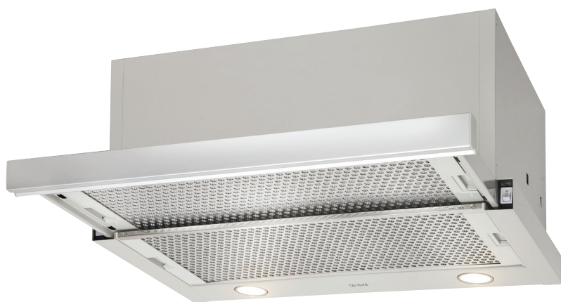
Pictured: CSP60 - 60cm Slideout Hood

Our new Telescopic hood with Mechanical controls and high efficiency led lighting are the perfect partner for ILVE's range of cooktops and freestanding cookers.