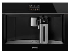
CMS4604NX Stainless Steel Trim