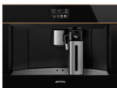
CMS4601NR Copper Trim