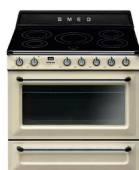
Panna (Cream) TR90IP2