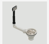
AC10 Basket Waste with Rectangular Overflow