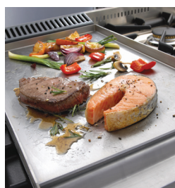
Pictured: ILVE Tepanyaki Plate