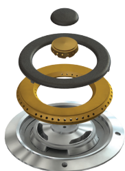
Pictured: ILVE Brass Burner

Functionally simple to use and a breeze to cook with, ILVE is truly the next generation in cooking.