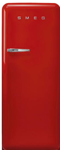
FAB28LRD5AU FAB28RRD5AU Red