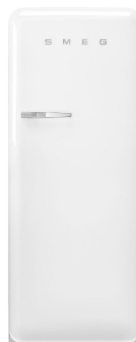
FAB28LWH5AU FAB28RWH5AU White