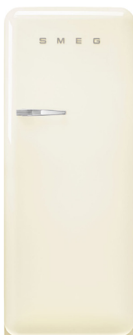
FAB28LCR5AU FAB28RCR5AU Cream