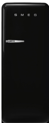
FAB28LBL5AU FAB28RBL5AU Black