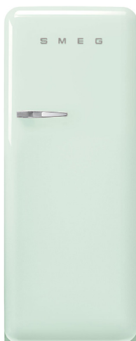
FAB28LPG5AU FAB28RPG5AU Pastel Green