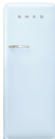
FAB28LPB5AU FAB28RPB5AU Pastel Blue