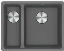
MRG660-34/15 SBL SG