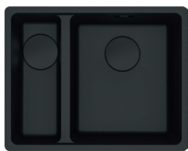
MRG660-34/15 SBL MB NOTE: Matte black waste included