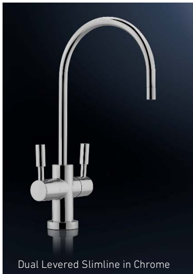
Dual Levered Slimline in Chrome

Instant chilled & sparkling filtered water