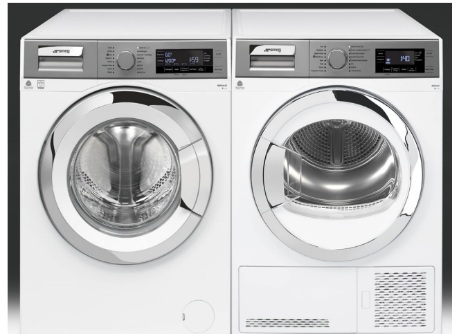
Pictured with Smeg SAWS1014 washing machine.

Tested and approved by The Woolmark Company for 'machine wash' labels. For best results follow manufacturer's instructions.