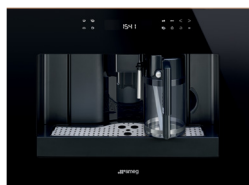
CMS4601NR Copper Trim