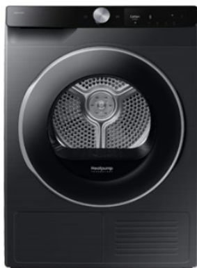
Matching Dryer DV90T6440LB