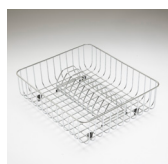
AC61 Drainer basket