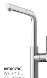
MT0079C WELS 4 Star 6.5L per min