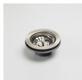
AC14 Basket waste kit