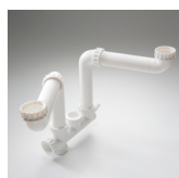
AC29 Opti-space connector kit