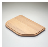
AC65 Bamboo board