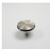
SP28B Basket waste plug