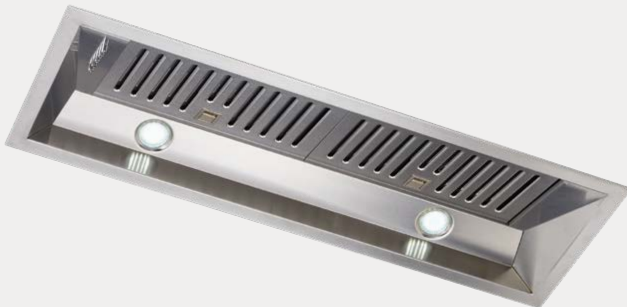
// DA-UM950S (90cm)