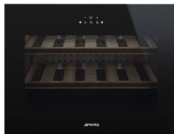
CVI618NX Stainless Steel Trim Right Hinge