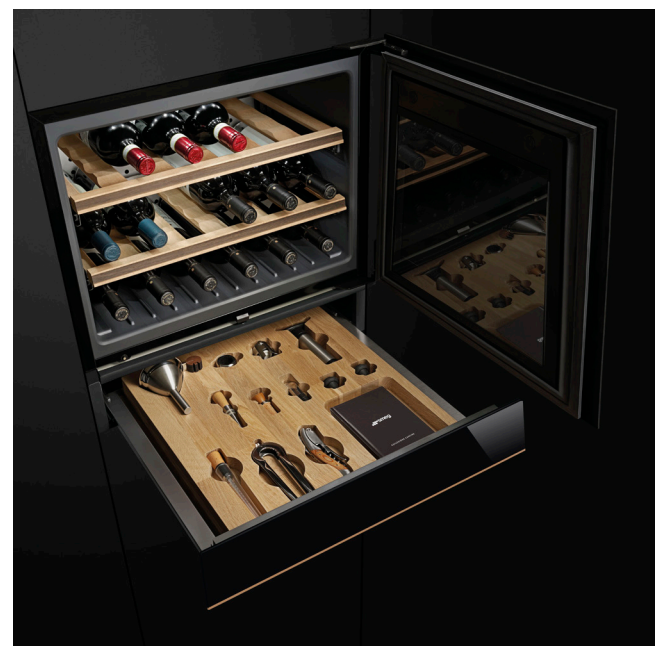
CVI618NR shown with CPS615NR sommelier drawer

Smeg wine cellars are equipped with an ultra-quiet cooling system which keeps vibrations down to a minimum. Even the smallest vibrations can affect wine by lifting sediments. This causes different components to mix, altering the balance developed during the ageing period.