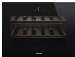
CVI618NRS Copper Trim Left Hinge