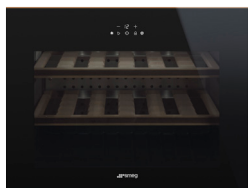
CVI618NR Copper Trim Right Hinge