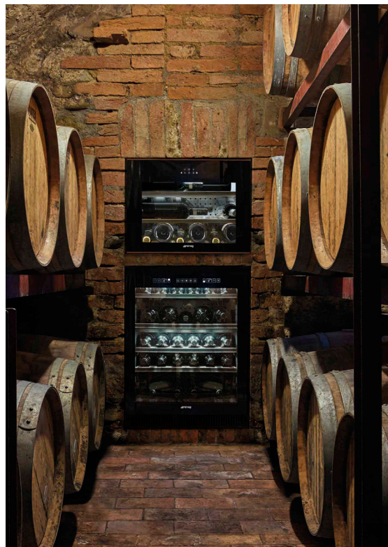
CVI618NR shown with CVI638N wine cellar