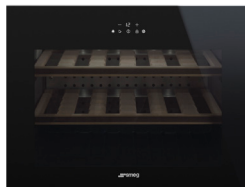
CVI618NXS Stainless Steel Trim Left Hinge