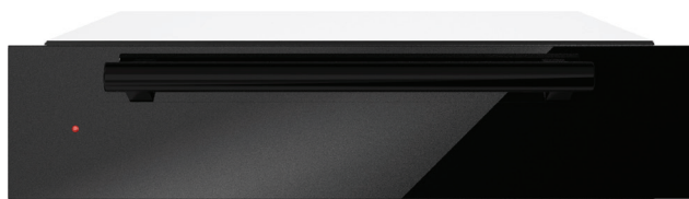
Pictured - 615SWD

Professional Plus represents ILVE's dedication to performance and versatility. The ILVE warming drawer is suitable for fitting directly beneath either a 60cm oven or compact oven. When combined with a compact oven, both items will fit a standard 60cm cavity, making a perfect companion beside an ILVE 60cm oven. The black tempered glass door make this product some of the most beautifully designed appliances available.